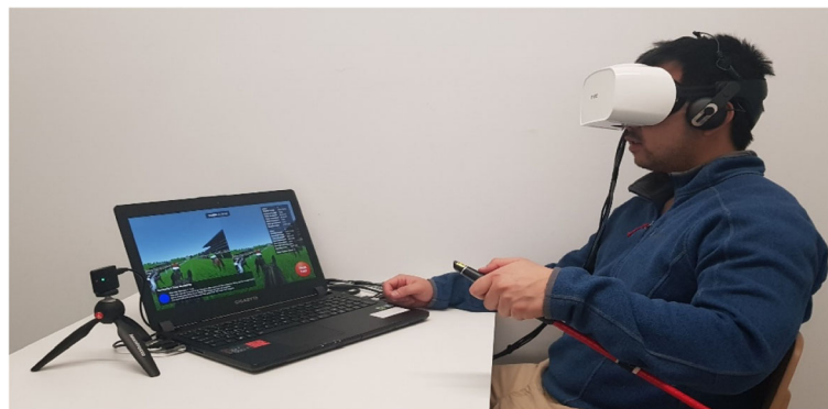
Fig. 1 The CONVIRT battery set-up. The Head Mounted Display (HMD) has a 2560 \times 1440 WQHD OLED screen with a refresh rate of 70 Hz (i.e., frames per second) that provides the visual display 1280 \times 1449 to each eye. The HMD provides a field of view of 100 degrees vertically and 88 degrees horizontally. The eye tracking unit embedded in the FOVE HMD has a tracking accuracy of less than 1 degree and a refresh rate of 120 Hz ( https://www.getfove.com ). A custom developed riding crop provides a button for a subject to press while retaining the natural feel of a professional riding crop. The riding crop is modified in such a way that the subject would hold it similar to reality and their thumb would rest on a push button. The riding crop connects wirelessly to the laptop and subjects press this button to interact with the CONVIRT application

The CONVIRT battery was trialled with professional jockeys ( n = 7 ) and jockey coaches ( n = 3 ) to ensure the virtual environment mirrored that of a professional horserace. Slight modifications to the gait of the virtual horses were recommended and then implemented. None of the jockeys or coaches reported any nausea or motion sickness. Careful consideration was given to following best practice design with a specific focus on reducing sensory-conflict and latency that are well known contributors to sickness when using VR [37]. To minimise impact from sensory conflict between vision and vestibular systems, the horses and user move along the track at a constant velocity of 20 km/h and accelerations are avoided. Modern headsets have significantly decreased latency times and in the design of CONVIRT, consideration was given to allow the frame rate of the virtual experience to run at the maximum possible framerate allowing the headset to have minimal delays (lowest latency) in updating the visual information displayed to the user. The events inside the VR experience (e.g. bobbing due to horse running motion) do not alter the height of the user's view within VR while riding down the virtual track. The user however can turn their head to view the track around them, or also lower or raise their head while sitting in the chair. This motion is