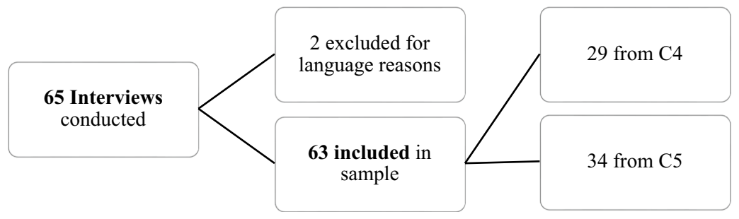
Fig. 2 Participants recruitment and inclusion of Agequake part 2

country for C2 and C3, as we do not have consent from participants to do so [22].) The included participants of the first part of the study are presented in the following Fig. 1.