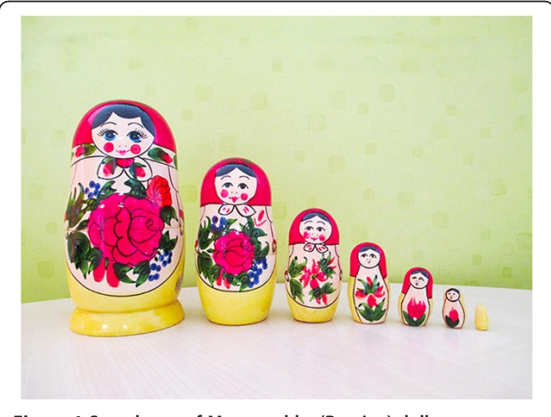
Figure 1 Sample set of Matroyoshka (Russian) dolls.

Having been seated, it was explained to each child that in this task they were going to be asked to look carefully at the dolls and then choose (one at a time) 3 dolls to represent someone they liked (positive charge), someone they did not like (negative charge) and someone that was just a person, that they neither liked nor disliked (neutral charge). The dolls were then placed one at a time in height order (height order direction randomised for each child) in front of them, along the back edge of a sheet of A3 paper. Next the children were told that each time they chose a doll, they should place it on the piece