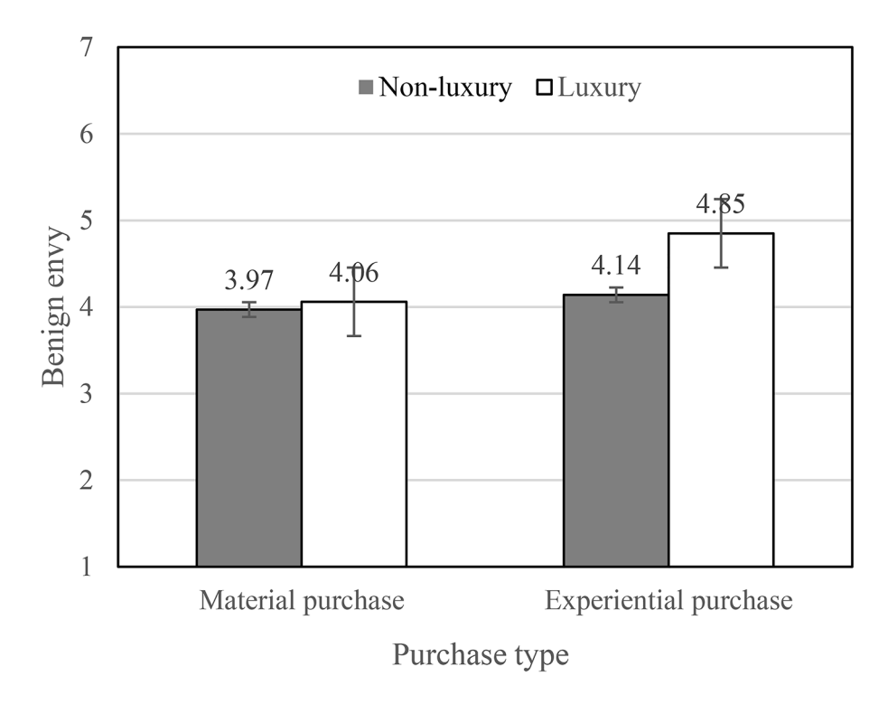
Fig. 2 The interaction effect of the type and luxuriousness of purchases on social media benign envy

Liu et al. BMC Psychology (2024) 12:157 Page 8 of 14